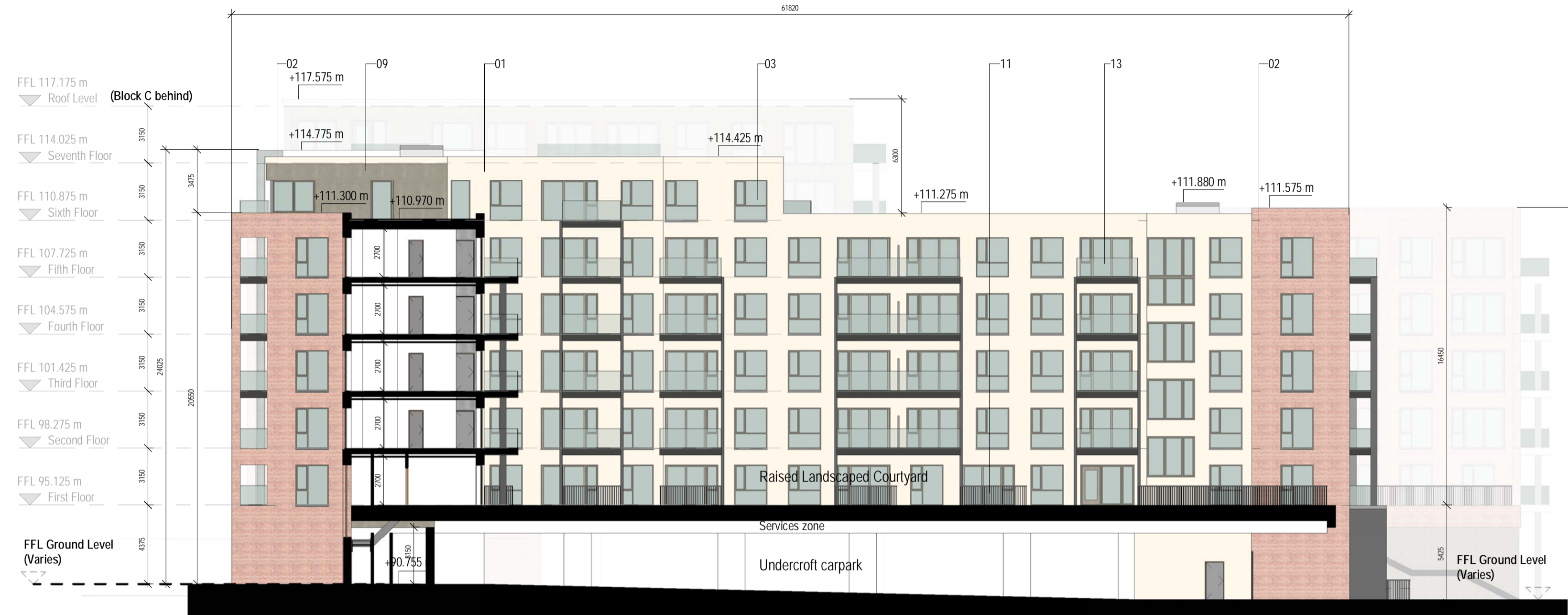
Cross Section E-E 1 : 200

ALL DIMENSIONS ARE TO BE CONFIRMED ON SITE DIMENSIONS ARE NOT TO BE SCALED FROM THIS DRAWING THIS DRAWING IS TO BE READ IN CONJUNCTION WITH CONSULTANTS DRAWINGS ALL WORK TO BE CARRIED OUT IN ACCORDANCE WITH CURRENT BUILDING REGULATIONS