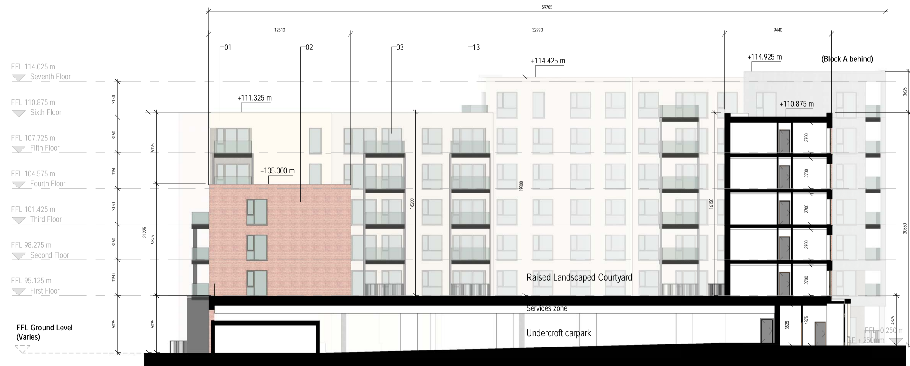
Cross Section F-F 1 : 200